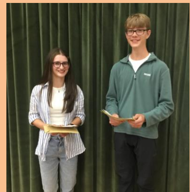
Congratulations to the Class of 2024