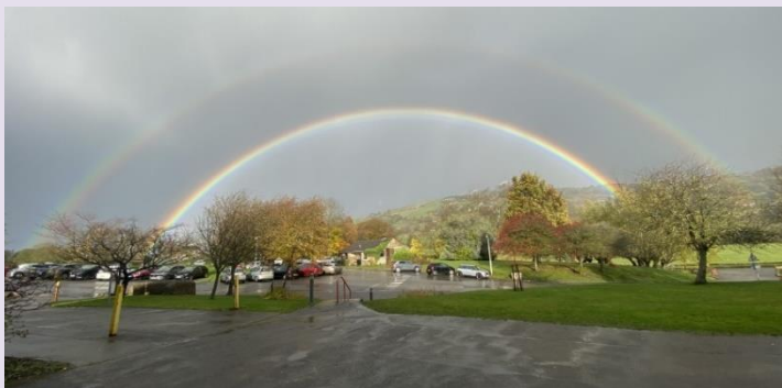
9.11.22